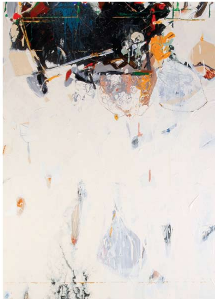
Above: Hayate Doostan (Life of Friends) from the Rumi in my Chalice series. 2008. Acrylic and pencil on canvas. Triptych. 120 x 100 cm each. Private collection, Dubai.