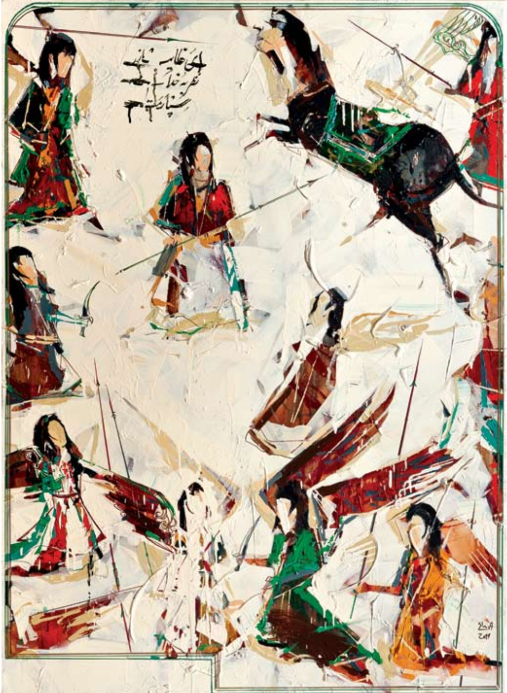
Above: Untitled, from the Miraj series. 2011. Acrylic and pencil on canvas. 180 x 130 cm.