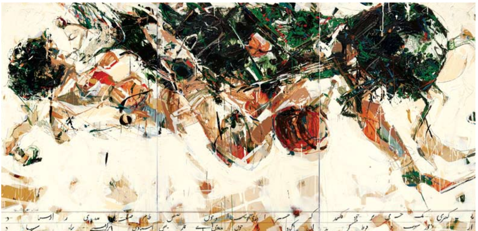
Facing page: (Detail) Untitled, from the Miraj series. 2011. Acrylic and pencil on canvas. 140 x 320 cm.